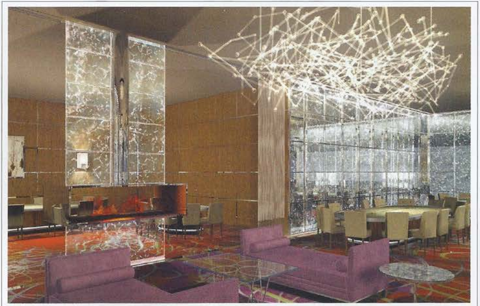
HIGH LIMIT GAMING ROOM, FOR THE W LAS VEGAS CASINO & RESORT